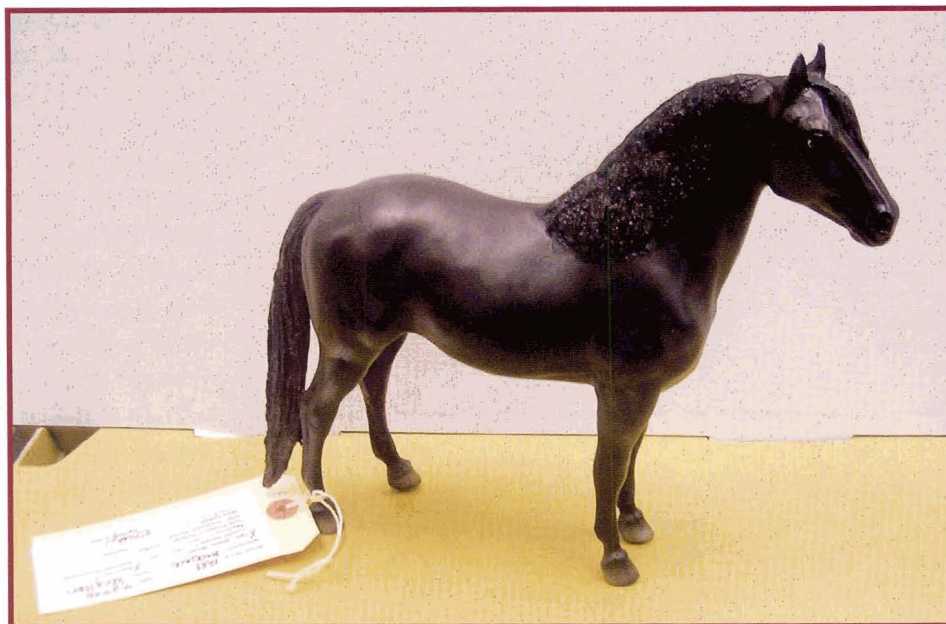
The title character from Ellen's first book, Blackjack , has been made into a Breyer model and will be available to the public in January.

as they are very particular about what books they will carry. Each book must pass through a stringent review process. It took several persistent phone calls and lots of follow up to ensure that my books wouldn't be lost in the piles of submissions and in the end it paid off. On average, I'd say I do two or three things each day to promote my books. It is definitely time-consuming and you can't be shy. But in the end, all the hard work has paid off!"